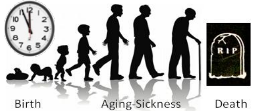
Birth Aging-Sickness Death

Grief ( sōka ), Lamentation ( paridēva ), Pain ( dukkha ), Depression ( domanāsa ), Exhaustion ( upāyāsa )